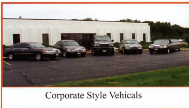
Corporate Style Vehicals